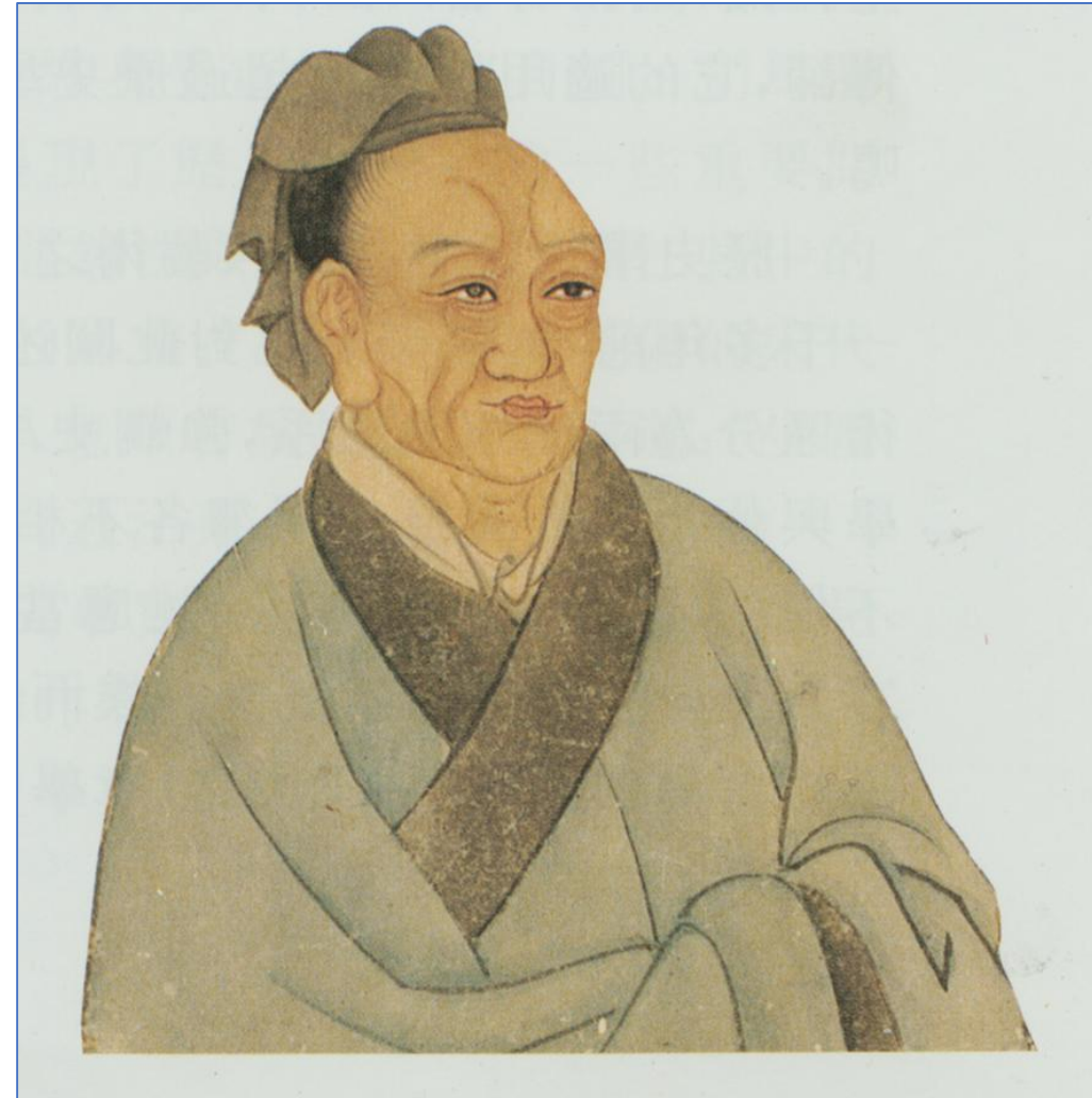
Sima Qian c 145 BCE – c 86 BCE