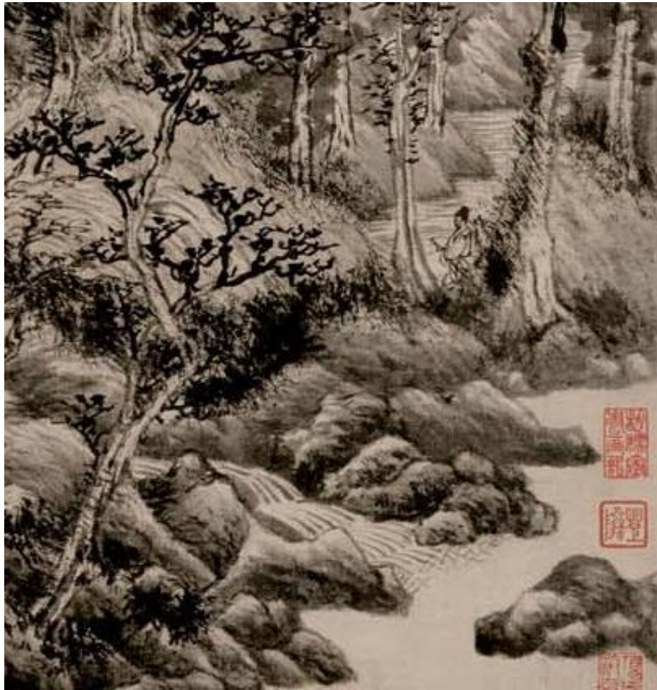
Wang Meng, 1308-85, Dwelling in the Qingbian Mountains, hanging scroll, ink on paper 1366, 141 x 42.2cm

By: Wang Meng - Licence: in the Public domain