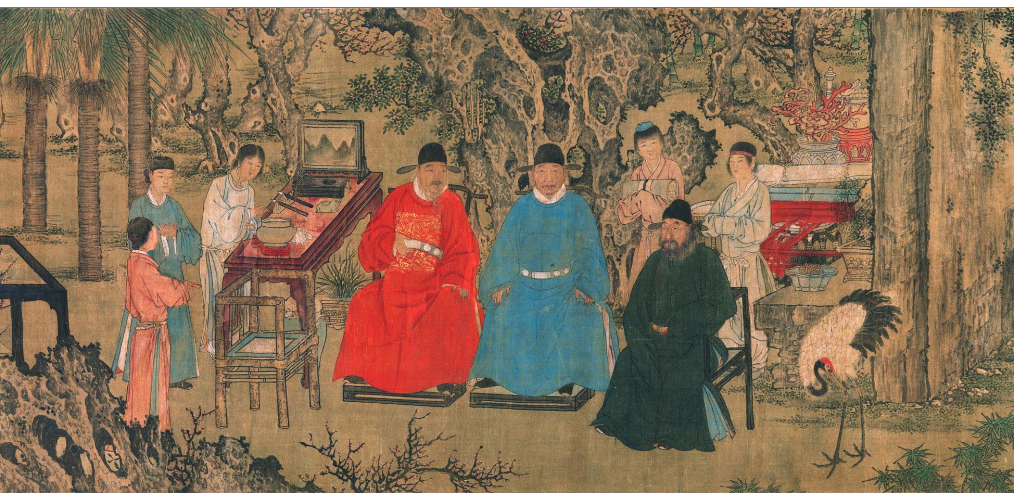
Elegant Gathering (of Scholar Officials) in the Apricot Garden Ming Dynasty c 1437 After Xie Huan