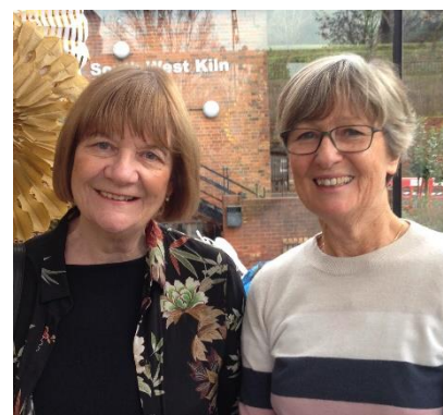
ANNUAL REVIEW 2021 EDITOR TBA